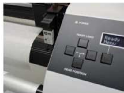
Simple & informative keypad controls with LCD information on metres plotted and line density.